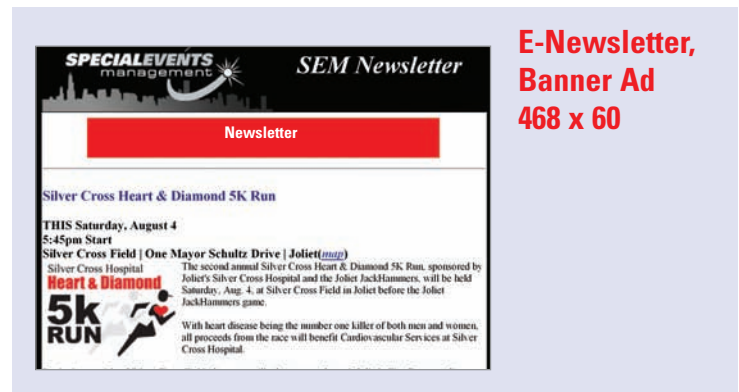
E-Newsletter, Banner Ad 468 x 60